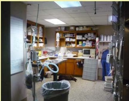
Before on left and After on right (Treatment area)