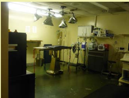
Surgery room Before on left and After on right